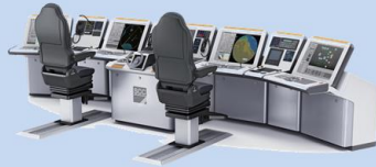
Engine Room / Engine Control Room